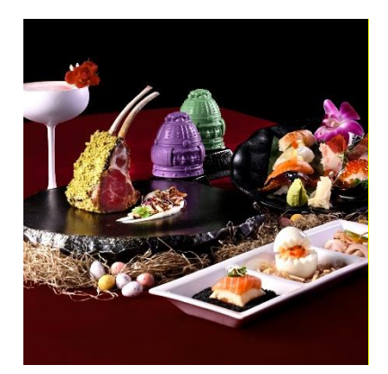
(clockwise from top left): Ichigo Sour; robata-grilled lamb chops; a pair of giant bells; eight-piece platter of assorted sushi; uzura egg & yellowtail jalapeño & salmon pillow

Reservations are encouraged; visit <u>marinabaysands.com/restaurants/db-bistro-and-oyster-bar.html</u> or call 6688 8525.