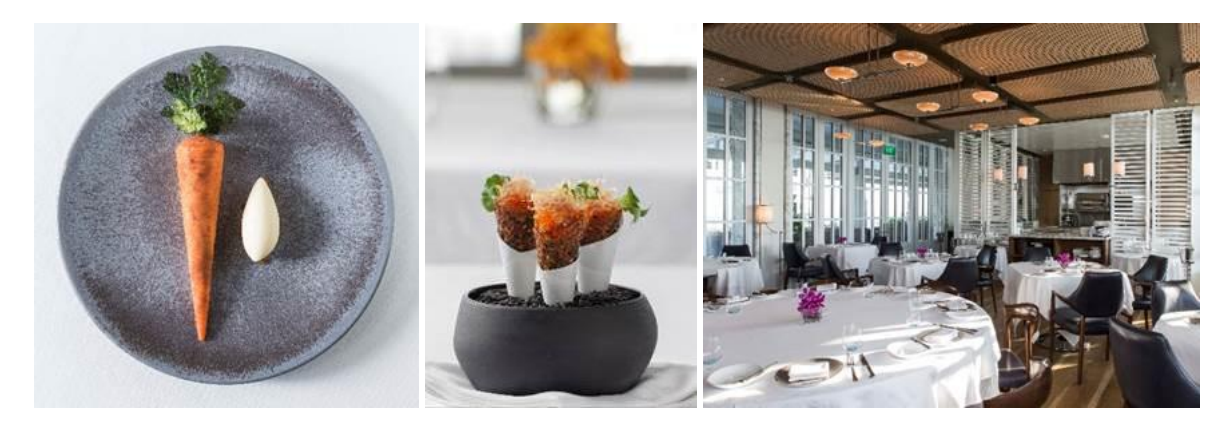
Impress loved ones with a leisurely Easter Sunday brunch at Spago (from L to R): carrot cake; tuna tartare cones

All Easter goodies are available for in-store purchase only from 4 to 17 April. <u>Sands Rewards</u> <u>LifeStyle members</u> can enjoy a 20 per cent discount, alongside 10 per cent earnings. Pre-orders are welcomed; visit <u>marinabaysands.com/restaurants/origin-and-bloom.html</u> or call 6688 8588.