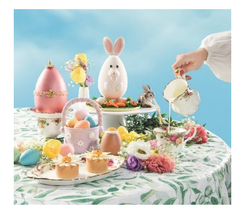
Garden inspired Easter creations await at Origin + Bloom (clockwise from top left): jewel egg and rabbit chocolate showpieces; sunny side up; flower tart; basket of colourful mini chocolate eggs

For reservations, visit marinabaysands.com/restaurants/mott32.html or call 6688 9922.